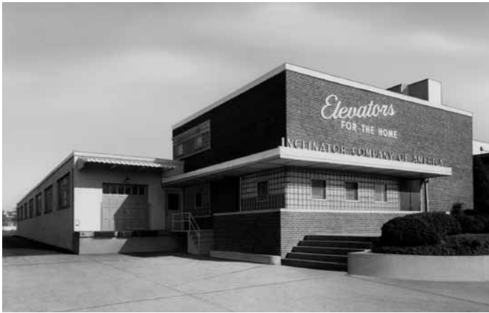
A previous Inclinor location