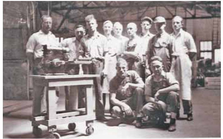
Workers at Inclinor in its early days

years, which will result in lower demand for home elevators. This, coupled with the fact that there are increasing numbers of suppliers of home elevators (many with very aggressive business models) will lead to downward price pressures. With less demand and more supply, it makes sense for us to look south into Mexico and beyond. We have been working on this initiative for about a year. In March 2013, we signed an agreement with a Bogotá, Colombia-based independent sales representative to help us understand the challenges associated with exporting successfully throughout Latin America.